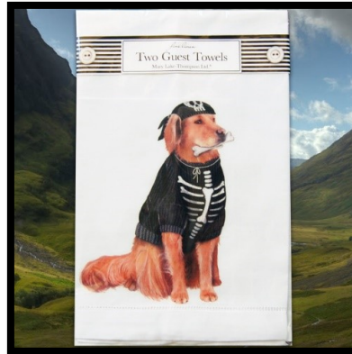
Golden Retriever Guest Towels.