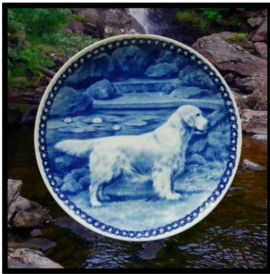
Danish Plate, The Golden Retriever.