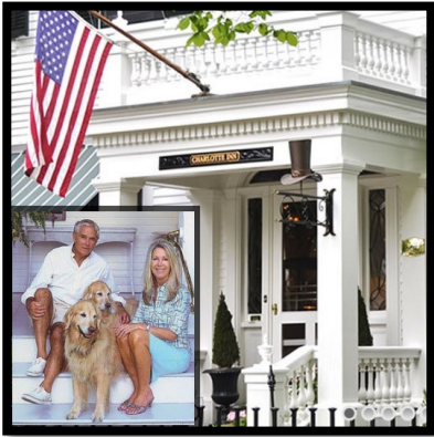
Barron's Dog Bibles: Golden