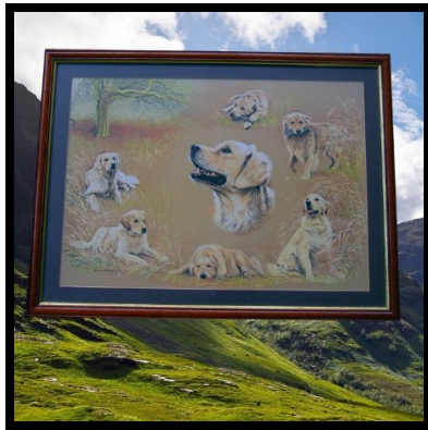
Golden Retriever in 7 Presentations