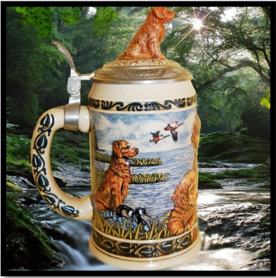
Man's Best Friend Stein