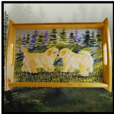
Golden Retriever Puppy Serving Tray