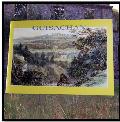
Guisachan: A History –Fraser