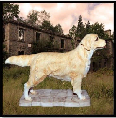
Hunter's Companion Series Stein